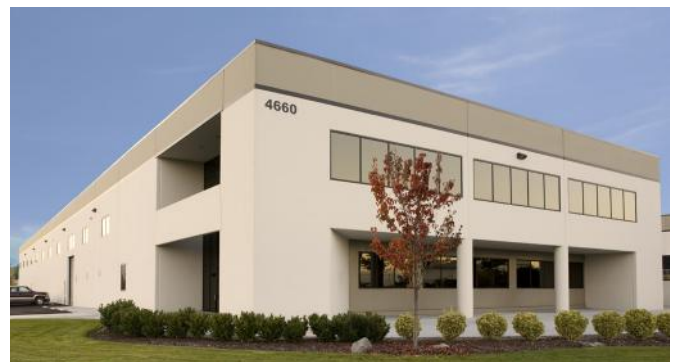
Grumman Building: Assembly and Shipping