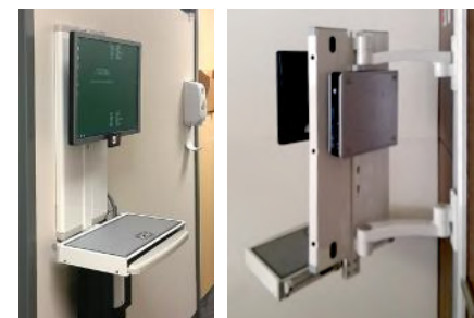
(Above left) VT21 workstation mounted in a corridor. (Above right) VTTM Tandem Arm mounted on a track. Arms are extended showing the Mini PC mounted on the back of the unit.