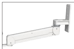
Elite Effortless movement and maximum reach. Available in all our mounting options.