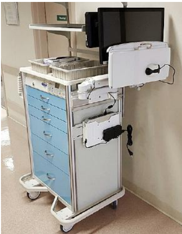
An Armstrong Smart Cart mounted with an Ultra 180 arm and A1 extension arm. This configuration provides a compact solution that combines the tasks of supply distribution and charting in one unit. Shown in the stowed position.