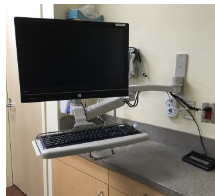
Elite 5220 arms with custom extension poles are mounted with computer workstations in a lab. The arms stow high against the wall to keep the corridor clear.