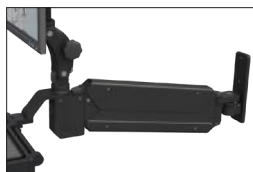
MD The best counter-balanced arm available. Wall and wall track mounting options.