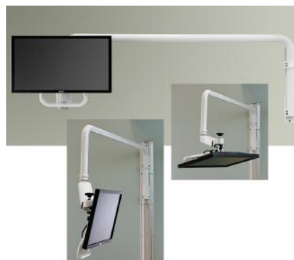
Overhead arm with 77" (196 cm) of reach and exceptional range of motion.

ICW's White and Black finishes are writable with dry erase markers.