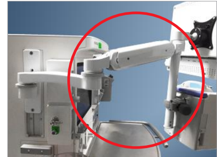
Computer workstation UL180EV7-W3-KUB-A1