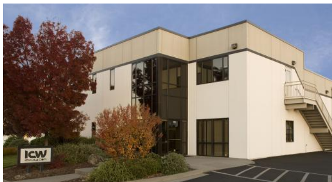
Kingsley Building: Engineering and Manufacturing, Administration, Information Technology

Watch a video tour of our plant at www.icwusa.com