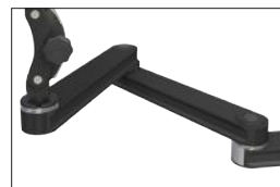
Titan Strong and versatile. Available in all our mounting options.

The Ultra 180 and Ultra 182 arms are protected by U.S. Patent 9,243,743.