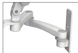
Ultra Move components independently. Wall, track and desk mount options.