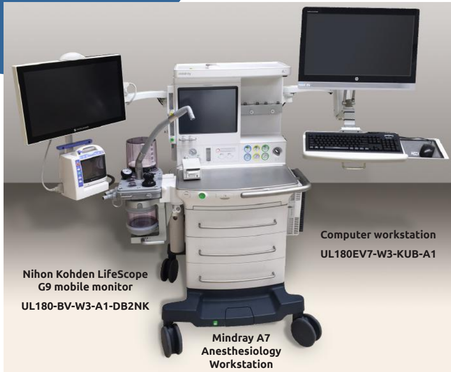
Nihon Kohden LifeScope G9 mobile monitor UL180-BV-W3-A1-DB2NK