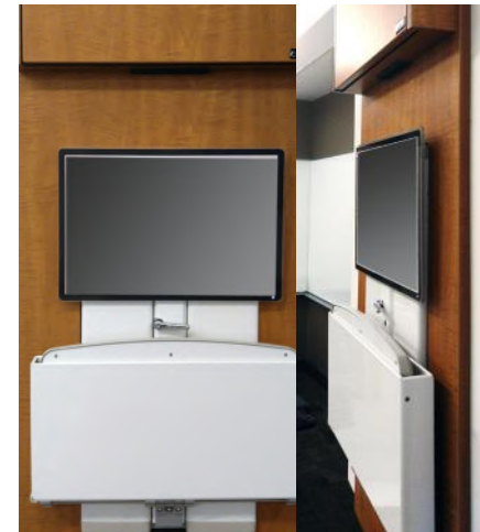
VT21 Low Profile mounted into a cabinet. Shown in the stowed position. Stowed depth 4" (10 cm), extended depth 17" (43 cm). The WorkSurface Tray provides a generous surface area for tasks. The VT21 series is available in three models: VT21, VTLP and VTTM.