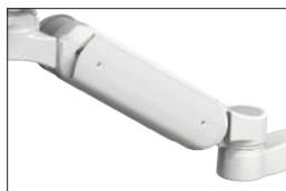
Ultra 180 & 182 The most versatile short arm in the world. Available in all our mounting options.